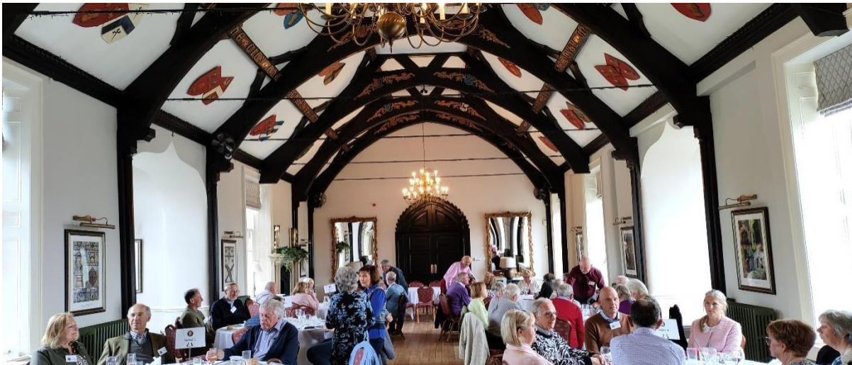
Sunday Lunch served in The Great Hall at Vale Royal Abbey Golf Club

The 46 members present expressed their congratulations to all the above. Minutes from the NorceMog AGM will be found elsewhere in the Newsletter.