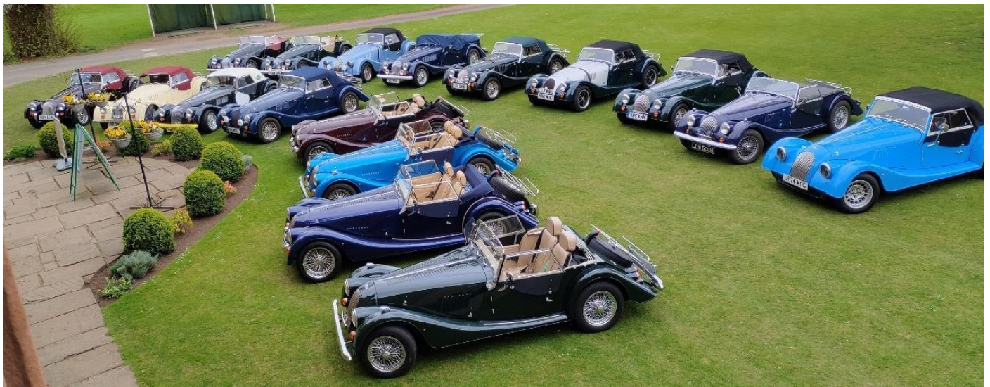
Privilege parking at Vale Royal Abbey

Final preparations were being completed at The Abbey as the residents of Whitegate were aware of a rumbling permeating the atmosphere on Vale Royal Drive. In the library spotless cups and saucers awaited the expected throng when, suddenly, the rumbling increased to a tremendous crescendo, golfers covered their ears, the windows rattled in their 13 th century frames and Dave Roberts's Plus Eight parked on the lawn at the rear of The Great House!. Never one to make a quiet entrance our David.