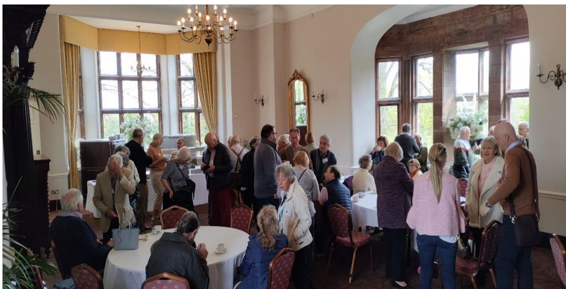
Members catch up before lunch

Vale Royal Abbey Golf Club hosted the 2025 NorceMog AGM with members arriving from 11.00am to be served refreshments of tea and coffee whilst catching up on all the gossip since our last meeting.