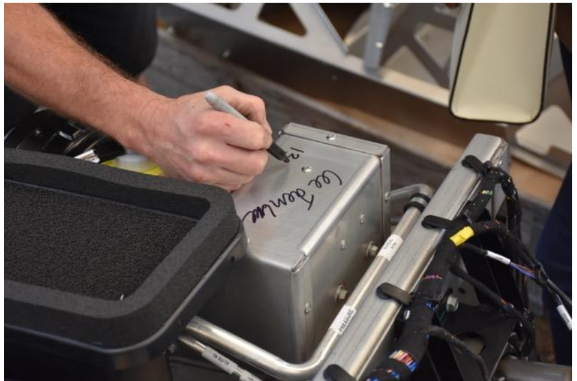
Pic 3: Signing of the Chassis.

At the end of the tour, we were invited back to the chassis shop to meet the chap who had spent 2 days assembling the chassis, and he kindly added his signature and date in the engine bay - apparently it was his birthday too. Fabulous !! (see pic 3)