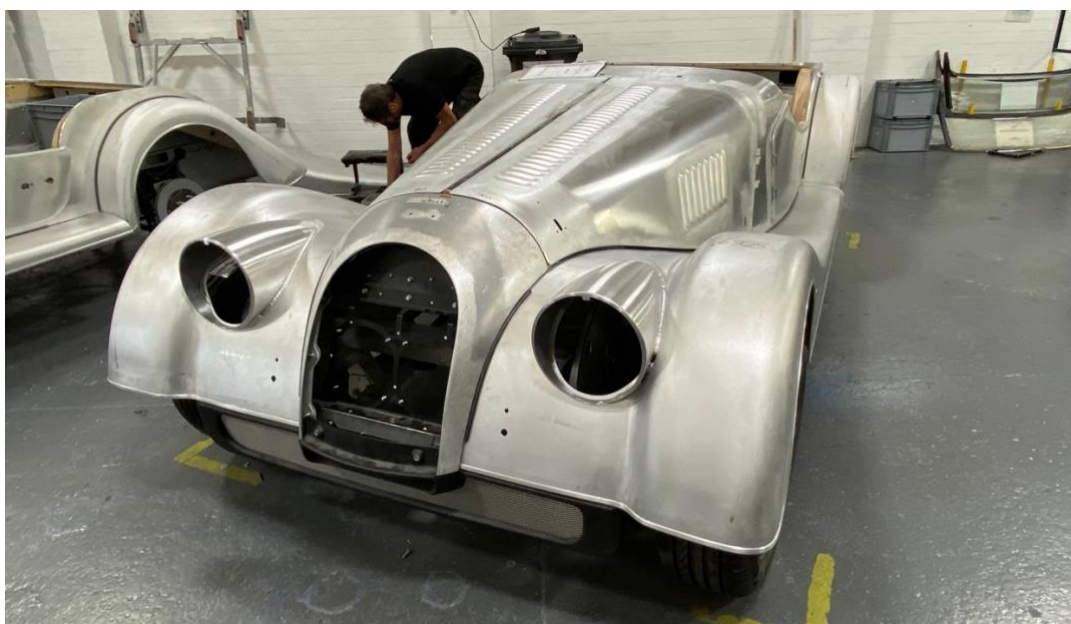
Pic 2: Plus Four Body.

As we walked up the hill of the factory internal road the tour host pointed out our car sitting outside (see pic 1) ready to receive the body (see pic 2). Where else in the world car you go to a car production line and be shown your car ?