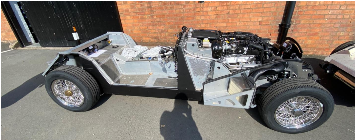
Pic 1: Plus four chassis

We drove down and arrived for the 11:20am factory tour. We were pleasantly surprised when we checked in at reception that they knew that we had a car in build and that the factory tour host and guide would point out our car as we went through the factory.