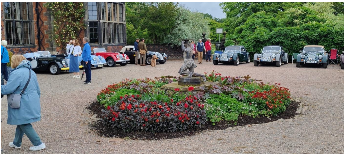
Superb line up of Morgan's spanning 50 years.