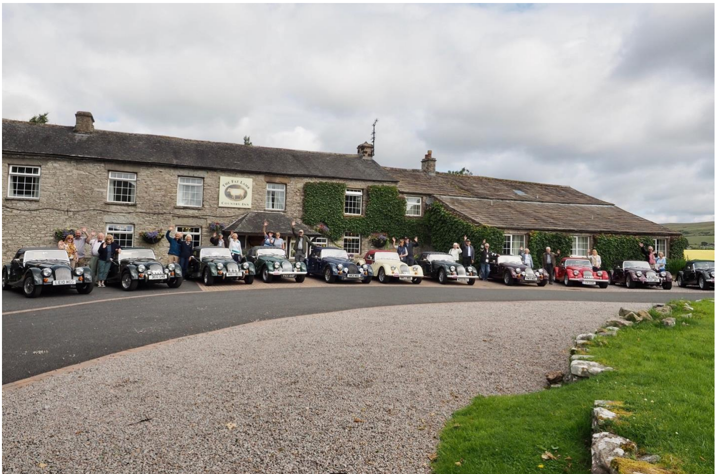
Fat Lamb 2023.

In 2023 the cost was £495 per couple + £95 per car for the excursions so budget for an extra 10% at least for 2025.