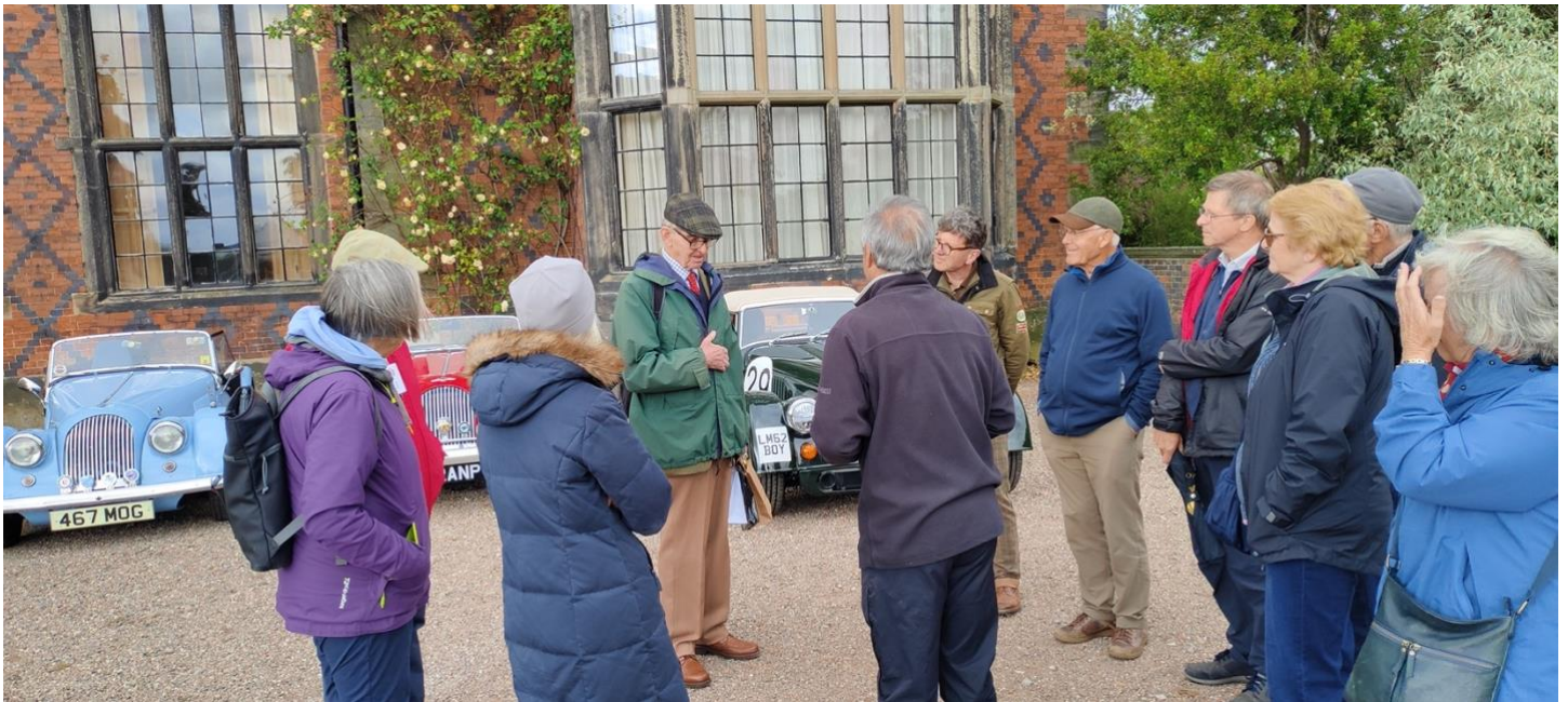
Viscount Ashbrook holds 'court'.