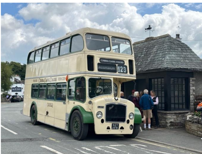
Vintage Coach trip

Day 4: Today is home time but we have planned a nice drive to Morecambe for a walk along the prom, look at the site of the The Eden Project Morecambe, and enjoy a snack before returning home.