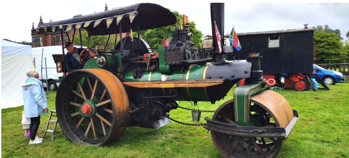
Thomas Green steam roller built 1924.