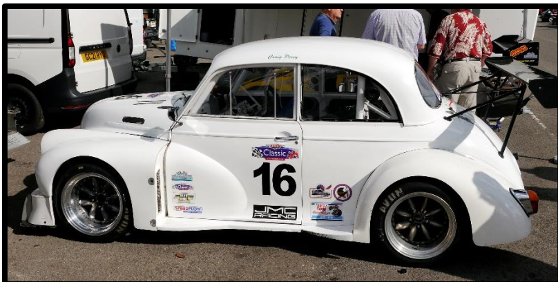
V8 6.2L Morris Minor! Modified Production Saloon