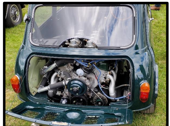
V8 Buick Mini! (Not racing)