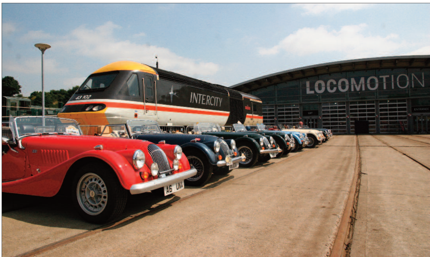
Members Morgans line-up on the apron at Locomotion, the National Railway Museum at Shildon on 21st July, during the NorceMog 'Escape from Lockdown' Spring Tour.

...let's all keep on track with Miles of Morganeering