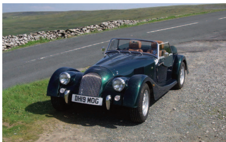
Derek and Sue Hainsworth's 2019 Plus 4 at Buttertubs Pass, during a drive on the high roads, with far reaching views, in the natural beauty of the Yorkshire Dales in June 2021