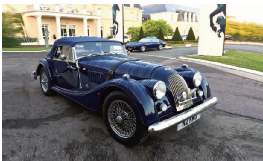
Kevin Osborne's 2001 4/4, hood up and ready for a rainy early morning start in the prestigious event at Chantilly Arts d'elegance France in 2019.