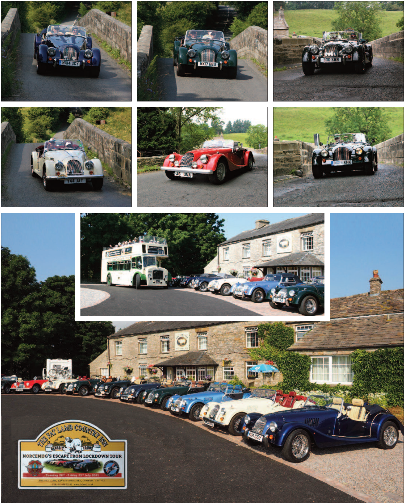
Top: Some of the Morgans driving on the 100 mile scenic route. Centre: Members departing for the Yorkshire Dales on the open top bus. Below: The line up of Morgans creating an impressive fascia to the Fat Lamb.