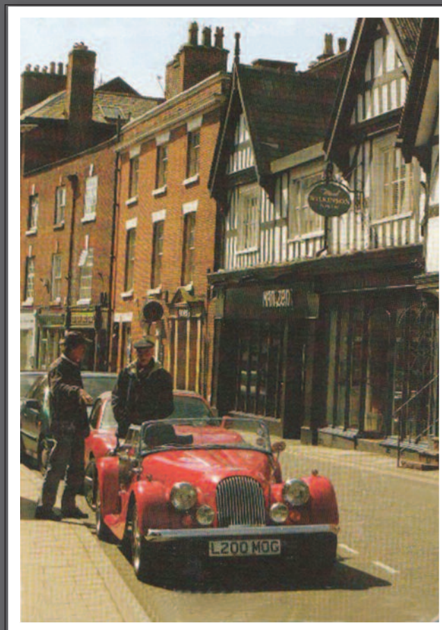
Me with my 1994 Plus 4 in King Street, in the architecturally historic market town of Knutsford in March 2006

Creative Director!...with this photograph, who is he kidding, you might think. But the quality is due to being scanned from an early Cheshire Life magazine.